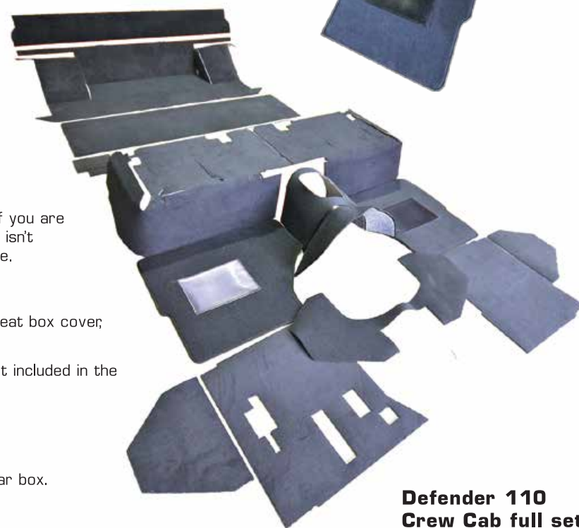
Defender 110 Crew Cab full set

Just check each panel by offering the panels to the vehicle first to be sure of how it fits before you use the glue. The kit will bond very well and it is advisable to just bond a small area before you commit to fixing the panel, this will leave some room for adjustment.