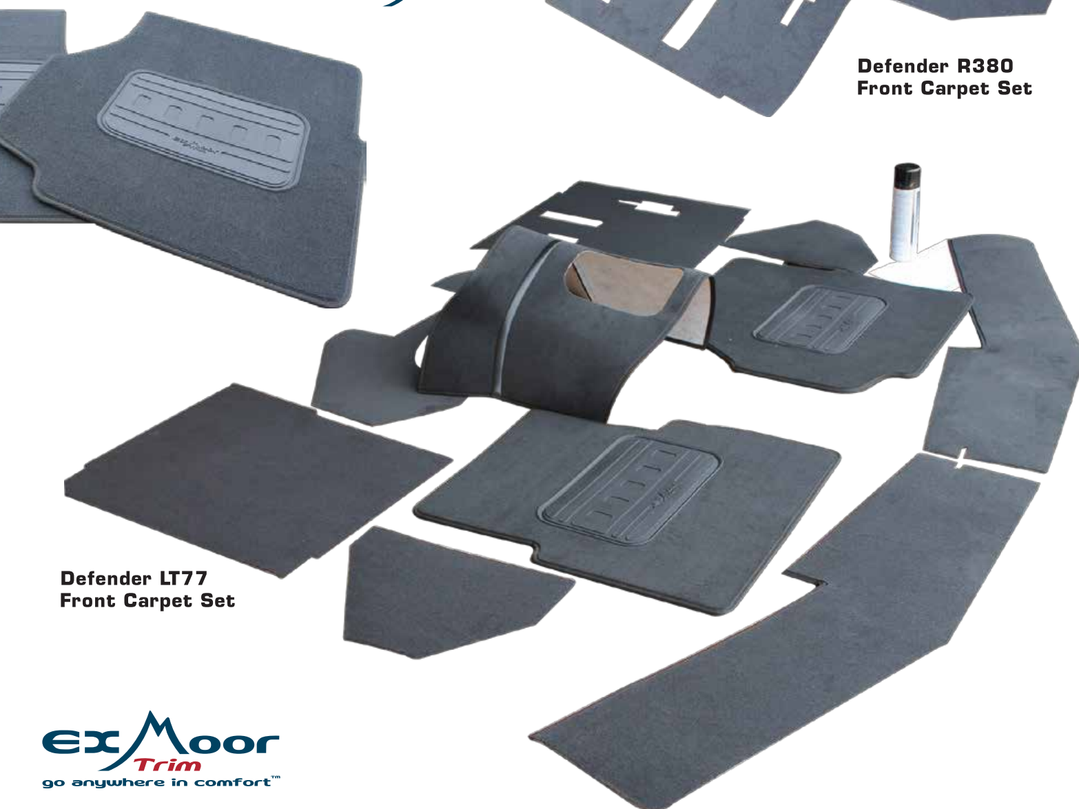
Defender LT77 Front Carpet Set