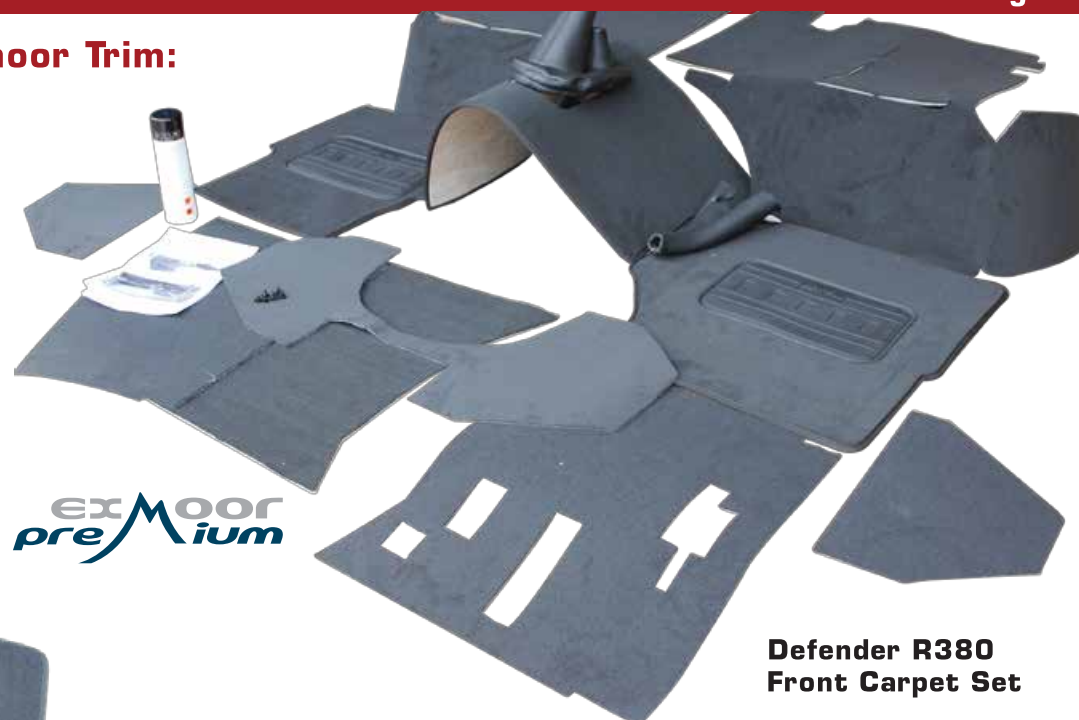
Defender R380 Front Carpet Set

Available for: Series II & IIA & III Defender with LT77 gear box tunnel Defender with R380 gear box tunnel